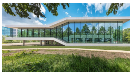
omnia wageningen | wie | rockhoef | broekbakema